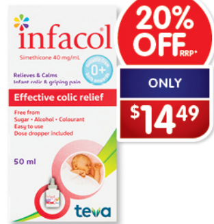
INFACOL Effective Colic Relief 50mL

25% OFF Selected Sudocrem Range ONLY $17.99