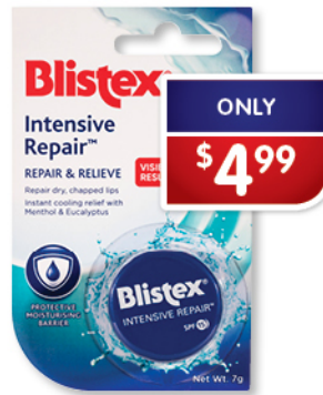
BLISTEX Intensive Repair Pot SPF15 7g