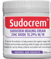
SUDOCREM Healing Cream 250g

25% OFF Selected Aveeno Baby Range ONLY $16.99