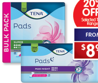
TENA Super Pads 30 Pack $19.99 Maxi Night Pads Extra Long Length 14 Pack $8.99