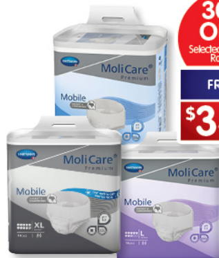
MOLICARE Premium Mobile 6 Drops 14 Pack $34.99 8 Drops 14 Pack $38.99 14 Drops 14 Pack $42.99

30% OFF Selected MoliCare Range FROM $34.99