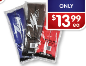
MEDI-PAK Hot Wheat Pack Long