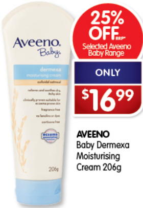
AVEENO Baby Dermexa Moisturising Cream 206g

25% OFF Selected Aveeno Baby Range ONLY $16.99