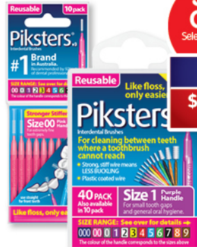
PIKSTERS Interdental Brushes Assorted sizes 10 Pack $5.49 or 40 Pack $16.49

30% OFF Selected Piksters Range FROM $5.49