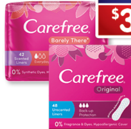
CAREFREE Barely There Scented Liners 42 Pack $3.99 Original Regular Liners 48 Pack $4.99