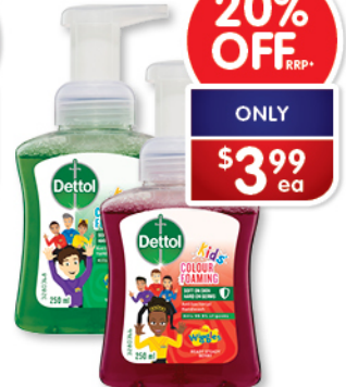
DETTOL Kids Colour Foaming Handwash Aloe Vera or Berry 250mL

30% OFF Selected Piksters Range FROM $5.49