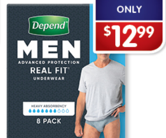
DEPEND Real Fit Underwear Men Medium 8 Pack

20% OFF Selected Poise Range ONLY $5.49 ea