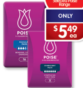
POISE Pads Regular 16 Pack or Overnight 8 Pack

30% OFF Selected MoliCare Range FROM $34.99