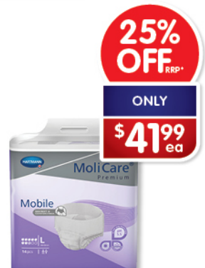
MOLICARE Premium Mobile 8 Drops Medium or Large 14 Pack