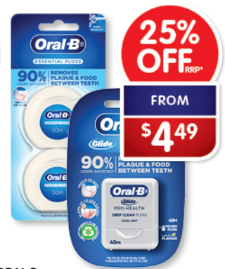
ORAL B Essential Floss Waxed 50m 2 Pack $4.99 or Glide Pro-Health Deep Clean Floss 40m $4.49