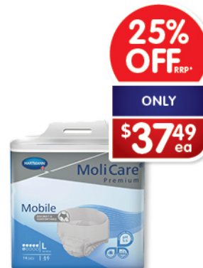
MOLICARE Premium Mobile 6 Drops Medium, Large or Extra Large 14 Pack