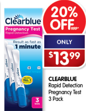
CLEARBLUE Rapid Detection Pregnancy Test 3 Pack