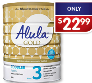
ALULA Gold Toddler 900g