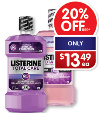
LISTERINE Mouthwash Total Care 1L or Total Care Zero Alcohol 1L