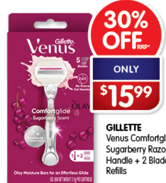
GILLETTE Venus Comfortglide Sugarberry Razor Handle + 2 Blade Refills