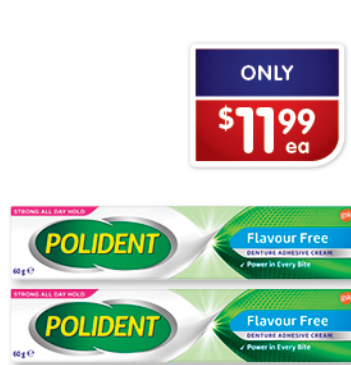
POLIDENT Denture Adhesive Flavour Free 60g