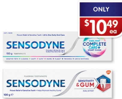
SENSODYNE Complete Care + Smart Clean Toothpaste Cool Mint 100g or Sensitivity & Gum Toothpaste 100g