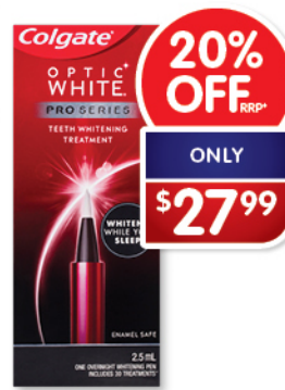
COLGATE Optic White Pro Series Teeth Whitening Treatment Pen