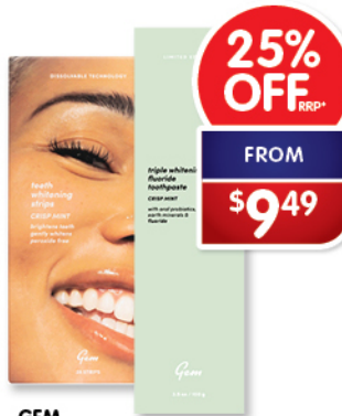
GEM Teeth Whitening Strips 28 Strips $36.99 Triple Whitening Fluoride Toothpaste Crisp Mint 100g $9.49